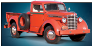
1949 DIAMOND T